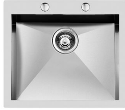
Sink Quadra 1216 050